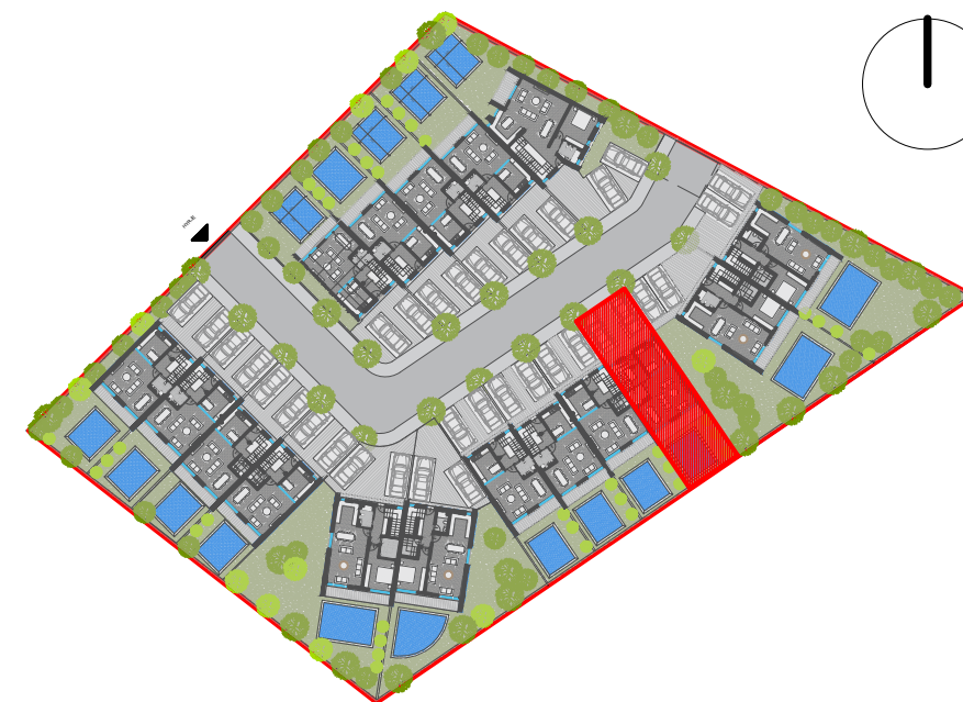
POZICIONIMI NE KOMPLEKS I VILES