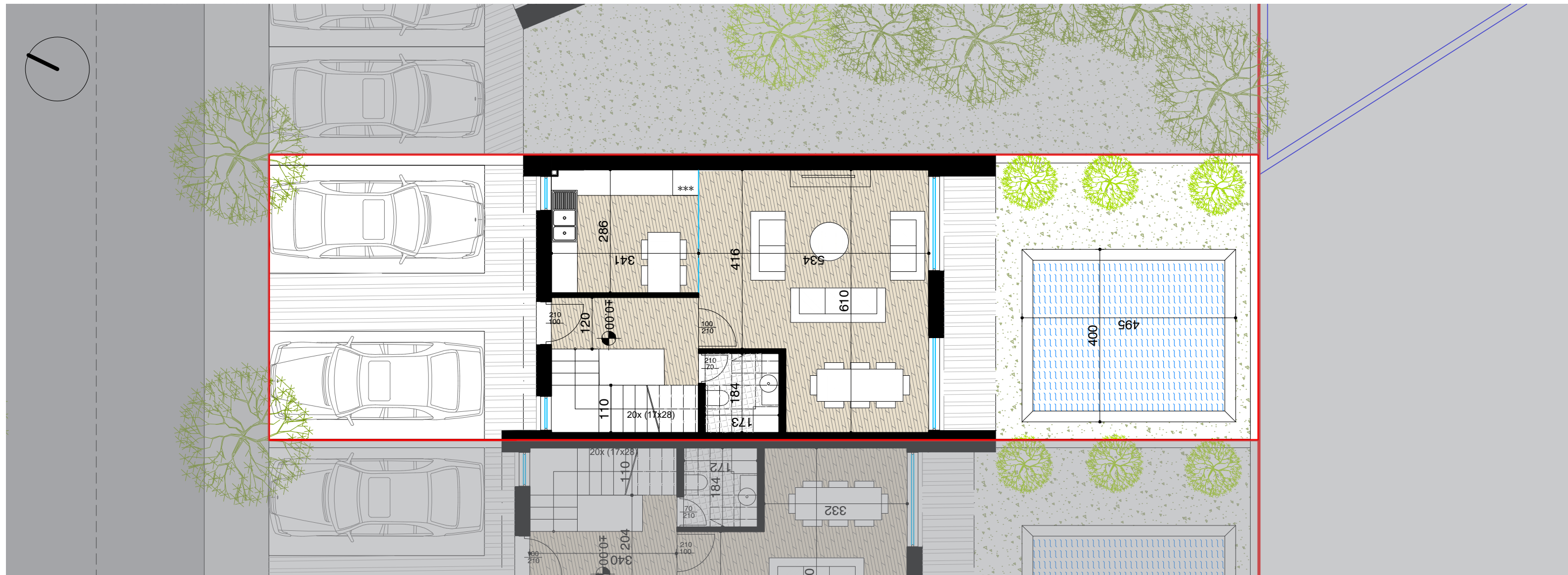
PLANIMETRI E KATIT PERDHE SH. 1:100